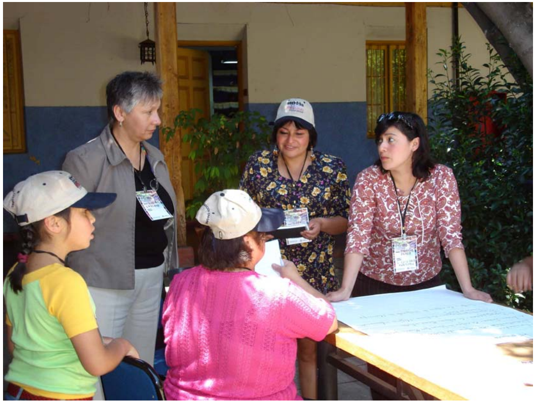
Local stakeholders participate in SEAT consultations at the Chagres Smelter in Chile

As a result of SEAT studies, a range of initiatives have been implemented: from a large enterprise development programme in Chile to community housing improvements in Australia and skills development programmes for unemployed youths in South Africa.